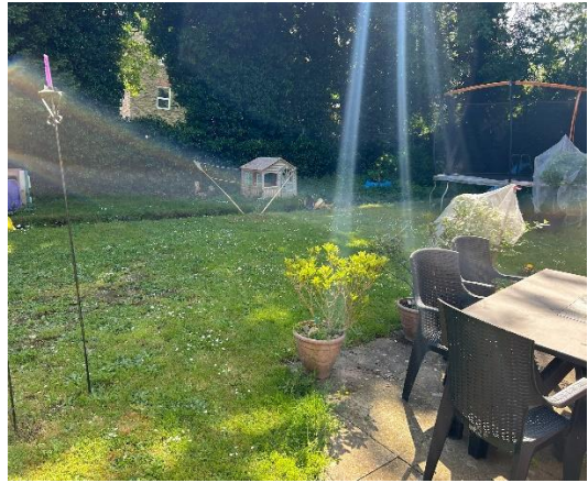
The vicarage garden