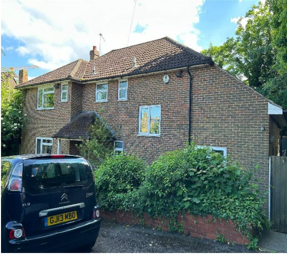
The front of the Vicarage